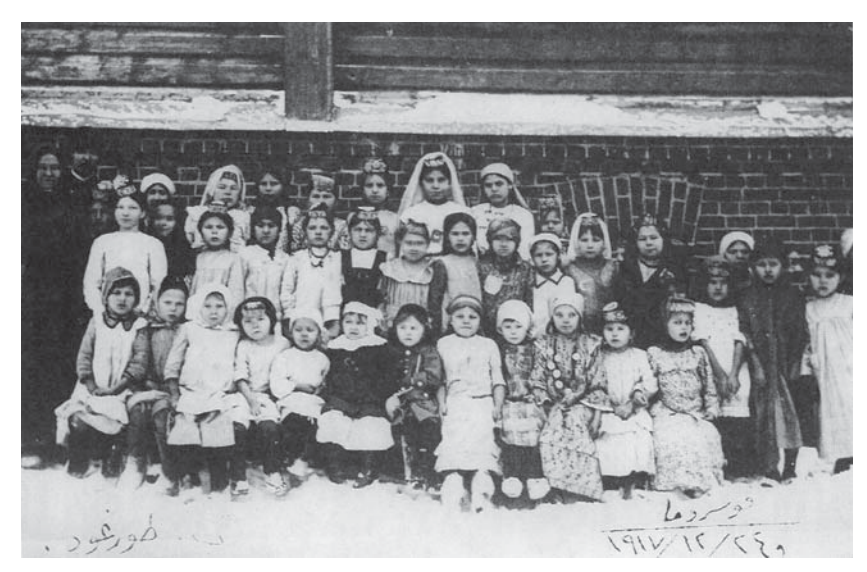
Girls elementary school in Kostruma (Siberia, 1917).