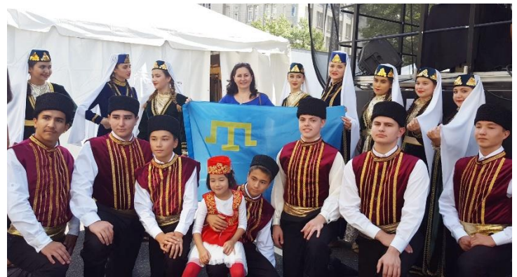
2. Folklore group Kırım Efsanesi at Turkish Festival