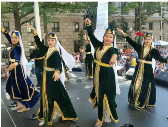
4. Crimean dancers performing at Festival

was a big hit at the Festival. We were all very proud of their performance and pleased to have the members of Crimean Tatar association here in DC. Unlike the ICC, the UHU is an organization with many volunteers, as there is a sizable Ukrainian American community in the area. Without their assistance in setting up the displays in the tent, it would have been very difficult for me to undertake the task. The long hours of preparing for the Festival and